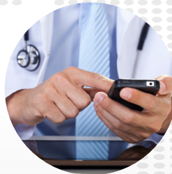
Technology & Data