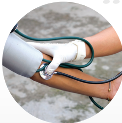
Health & WASH